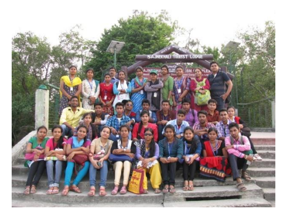
Our group in front of Sajnekhali Sanctuary

A campfire was arranged at night and all the students and teachers participated and enjoyed the whole programme.