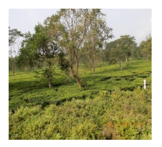
Pic.3: Tea Garden in study area