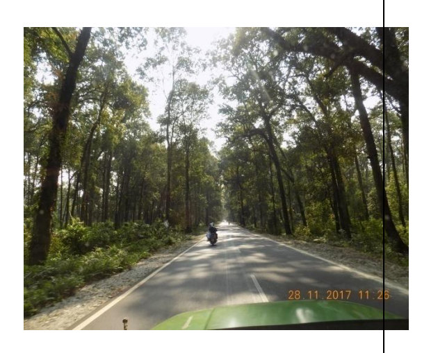
Pic.4: NH-34 running beside the Study Area