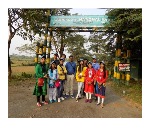
Pic.2: Bird Eye view of Tista River

Next day (2<sup>nd</sup> December), we reached Sealdah at 6:30 am and our journey was completed