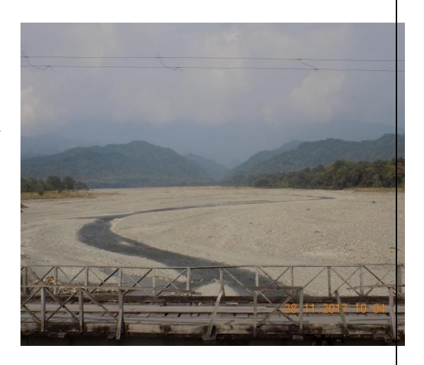
Pic.1: We at Gorumara National Park