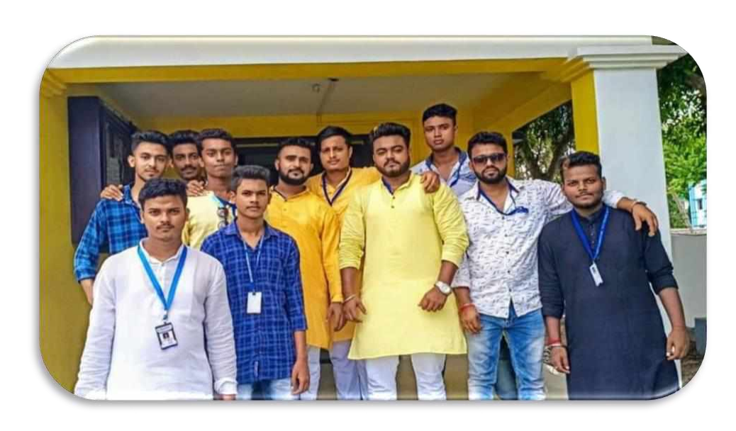
GLIMPSES OF NABIN NARAN PROGRAMME ORGANISED BY STUDENT'S COUNCIL