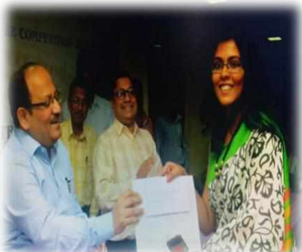
We won District Level Championship in 2017