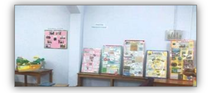
3D WALL MAGAZINE OF DEPARTMENT OF GEOGRAPHY