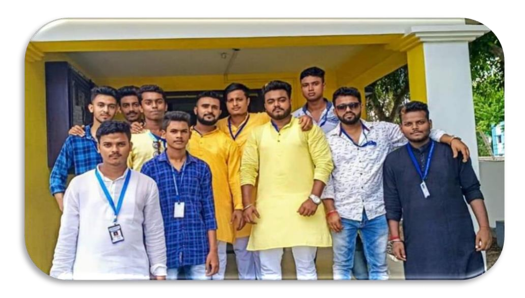
GLIMPSES OF NABIN NARAN PROGRAMME ORGANISED BY