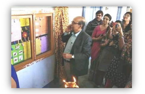
WALL MAGAZINE OF DEPARTMENT OF MUSIC

In addition to the annual college Magazine, the wall magazines of various departments also provide an opportunity for the students with a flair for creative writing.